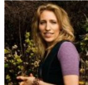
MUSICAL GUEST LAURA STORY Christian Singer & Songwriter